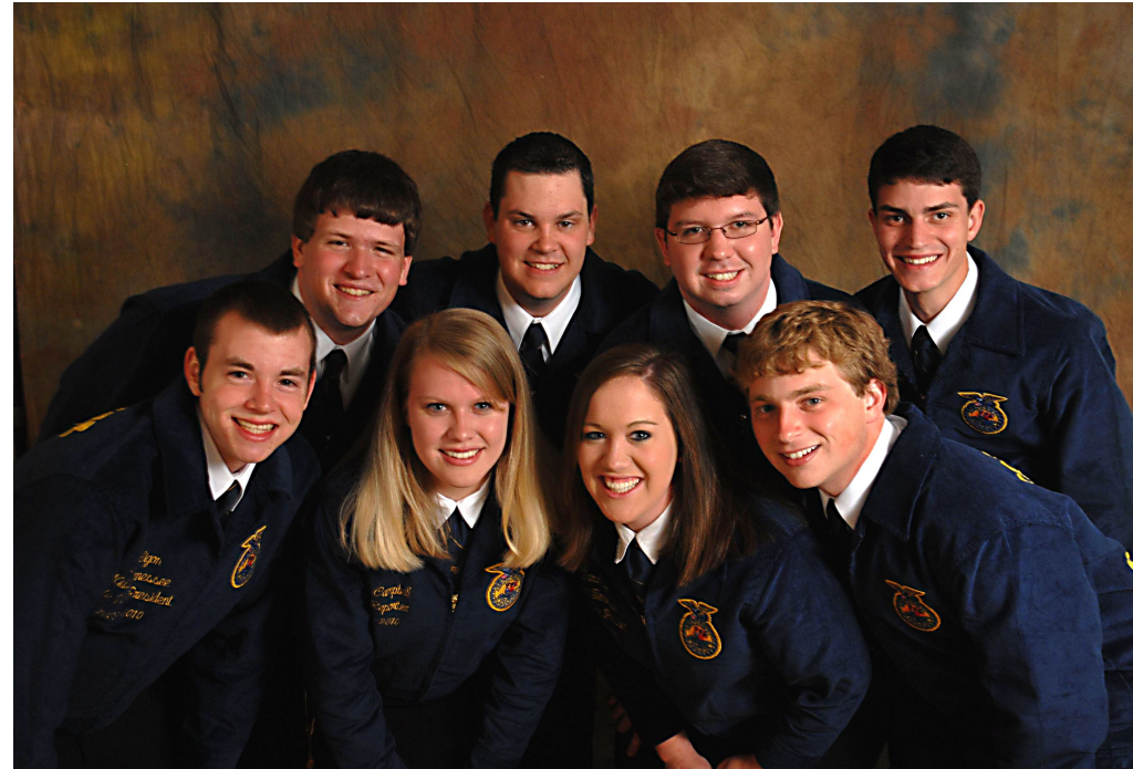
2009-2010 Tennessee State FFA Officers