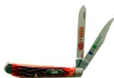
2011 "Farmers' Knife"

CO-OP's long standing support of 4-H and FFA continues with the 2011 edition of the commemorative knife program in cooperation with W.R. Case and Sons Cutlery. This year's knife is a popular two-blade, red-bone peach-seed, jig handle trapper that was formerly known as the "farmers' knife." It is now available at local CO-OP stores across the state. Thank you for the $25,000 donation split evenly between the FFA and 4-H Foundations.